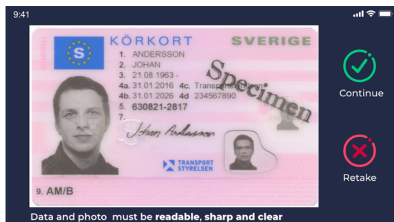
Check ID document image screen

We have also added a step during document scanning where users can more clearly see the image they have taken of their ID document. Again, there are instructions to pay attention to the image and to make sure it is clear and sharp.